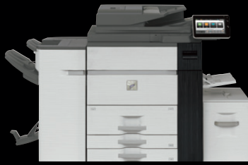
MX-M905 shown with 3,500-sheet large capacity cassette, 50-sheet Staple/Saddle Finisher and 100-sheet bypass tray.

The MX-M905 high-speed monochrome document systems offer flexible paper handling and finishing options to accommodate virtually any environment. *