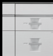
5,000-Sheet Air-Feed LCT