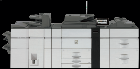
MX-M905 shown with Curl Correction Unit, Inserter, Multi-Folding Unit, 100-sheet Staple Finisher, 5,000-sheet large capacity trays, 500-sheet multi-bypass tray and status indicator.