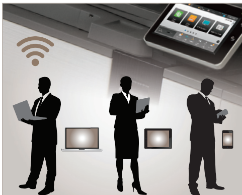
Built-in wireless network interface offers convenient scanning and printing from mobile devices.