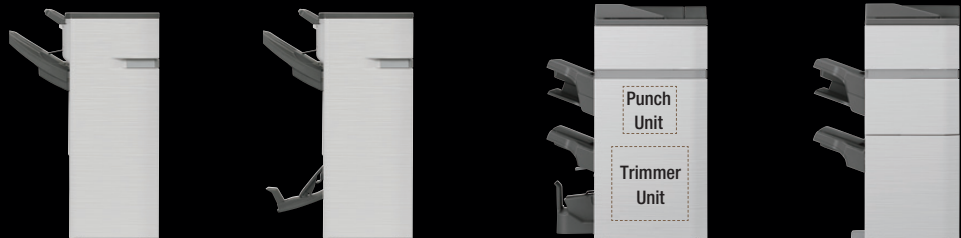
50-Sheet Staple Stacking Finisher