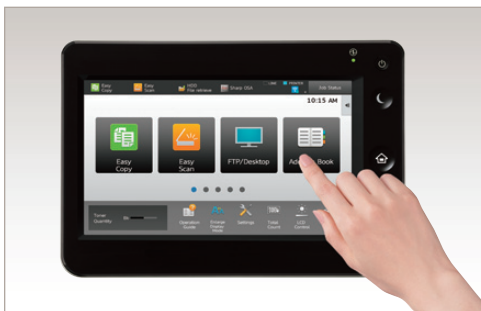
A high-resolution customizable touchscreen helps you navigate smoothly through advanced MFP functions.