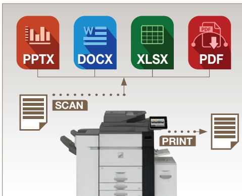
Scan and convert documents to popular file formats seamlessly with built-in OCR function.