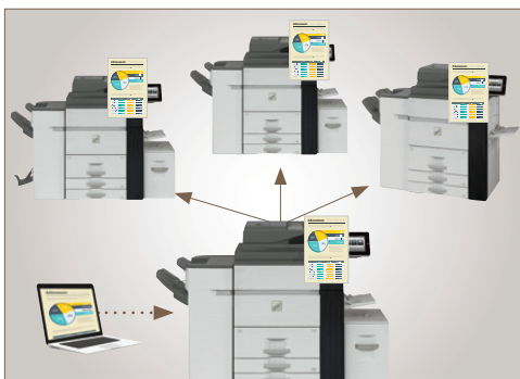
With Serverless Print Release technology you can securely print a job and release it from any of six supported models.

Powerful document workflow solutions help you work more efficiently.