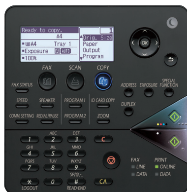
MX-C300W control panel.