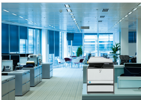
Compact yet powerful enough for workgroup environments.