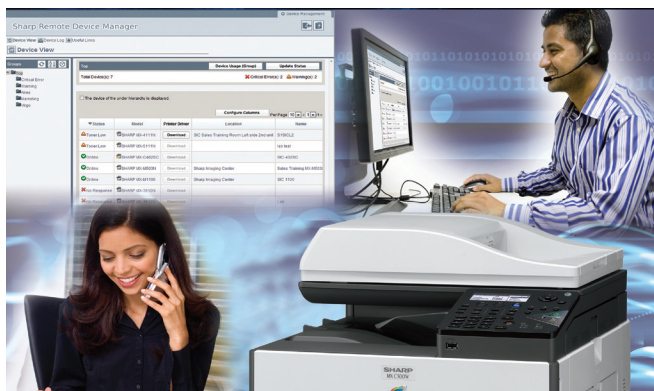
Sharp Remote Device Manager.