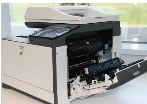
Convenient access to paper path from side panel door makes it easy to clear misfeeds.